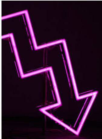
Dwy duedd allweddol