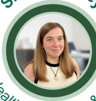
Head of Health, Wellbeing & Partnership