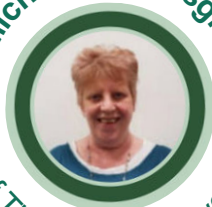
Head of Third Sector Development