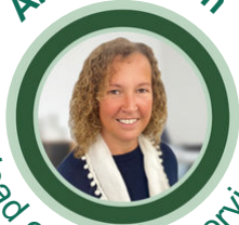
Head of Internal Services