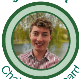
Chair of the Board